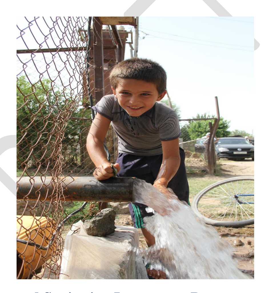
Water and Sanitation Investment Programme — Phase 1